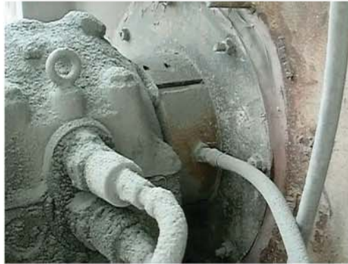
Fan housing covered in lime dust that was leaking out of the fan housing

End users widely accepted the initial Air Mizer-PS for its ability to boost overall reliability, reduce costs, extend sealing efficiencies and increase bottom line results without equipment modification, and they wanted more. By 2004, an entire product line began to evolve with the addition of Articulating Air Mizer and Smooth Bore designs.